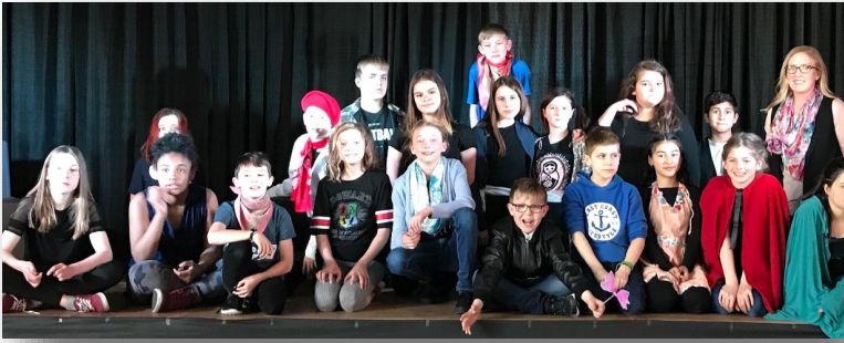
The incredible cast of our Grade 5/6 play Not-So-Gimm Tales. Knocked it out of the park!