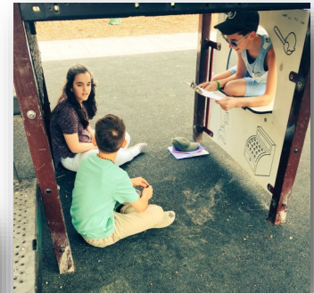
Mini Admin Team!