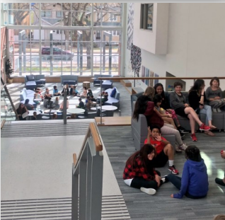
Groups meeting and working throughout our amazing building.