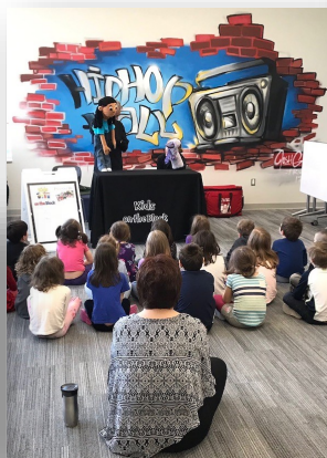
Kids on the Block! Teaching social skills and entertaining.