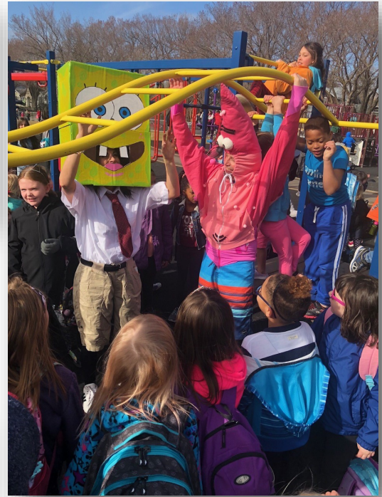
Congrats Comets! Huge accomplishment—SOAR Level !! SpongeBob and Patrick came out to play.